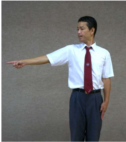
AKA JOGAI Point at the boundary of the competition area