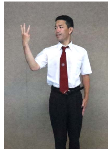
SANKAI Use index, middle and ring fingers to indicate third time