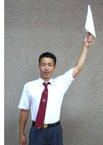
SHIRO NO KACHI in KOHAKU matches by the Referee Stand up, take one step forward and lift the white flag straight up