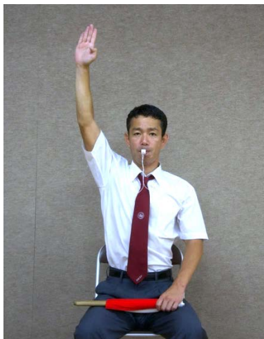
Draw the attention of the Referee, e.g. when a contestant of one's own country comes up