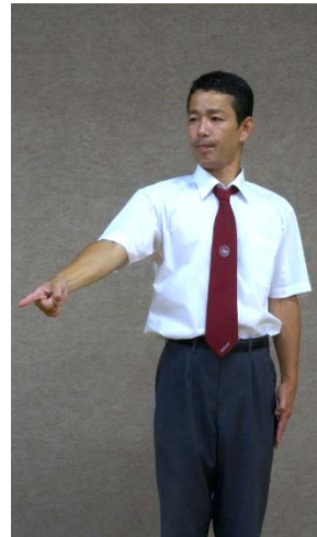
AKA KEIKOKU Point at the feet of the offender with the index finger