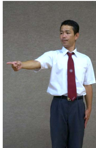
AKA HANSOKU CHUI Point at the chest of offender with the index finger