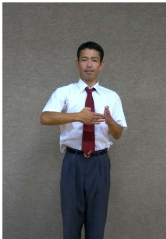
AKA HAI AI AKA's technique was faster / landed first