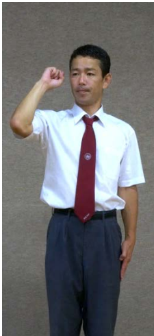
Preparatory movement for penalties