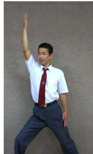
YAME Showing the opinion AKA IPPON