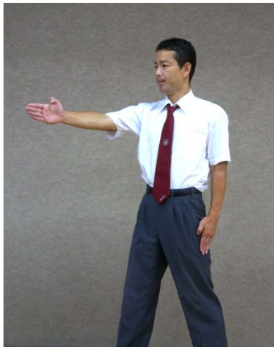
YAME Sweeping downward motion