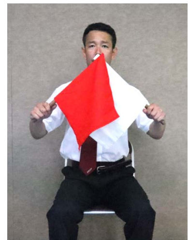
MIENAI Flags together below the eyes