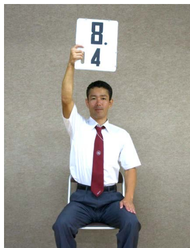
Raise points and show to the technical table for Referee and Judges