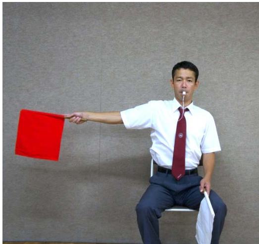
AKA WAZARI Arm straight out from shoulder