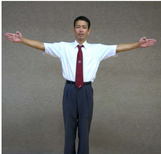
Inviting the competitors to enter the court Straight arms from the outside in

Following the gestures for the Referee during a KUMITE match: