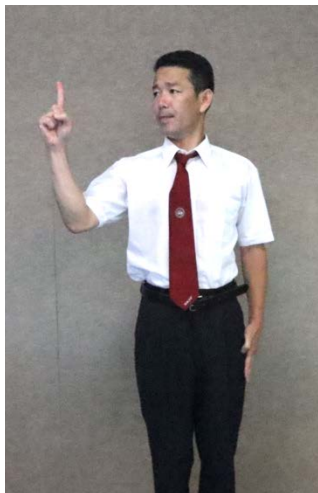
IKKAI Use index finger to indicate first time