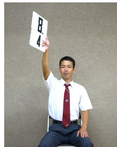
Turn points and show to the audience before lowering your points for Referee and Judges