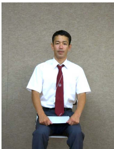
Correct waiting position for Referee and Judges with the point card