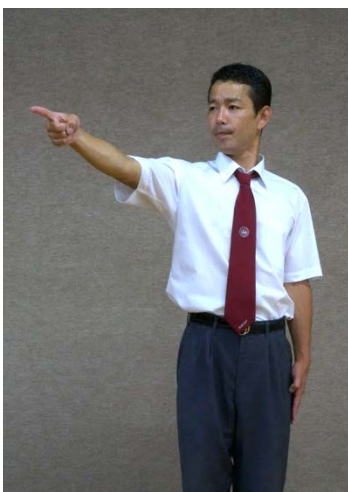
AKA SHIKKAKU Point at the face of offender with the index finger then out