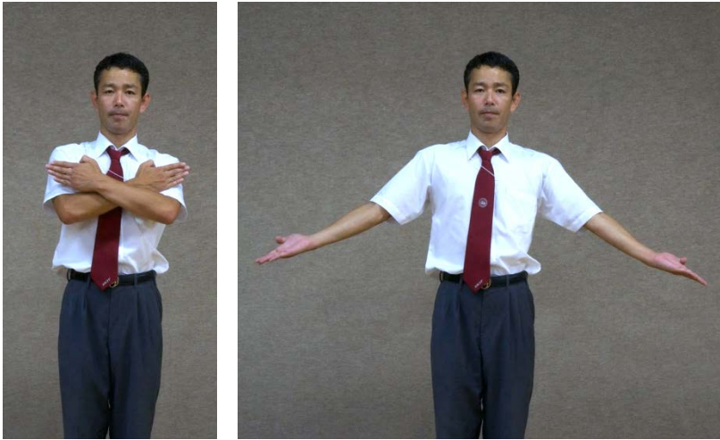
HIKIWAKE (only in team kumite matches) Arms 45°, palms facing up