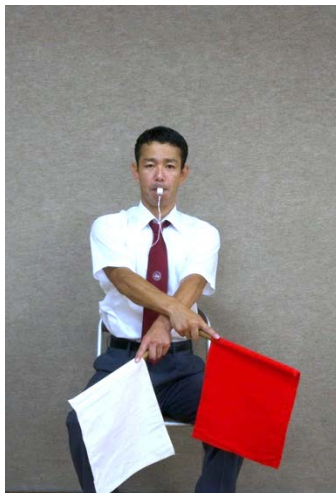
TORIMASEN Wave flags sideways once