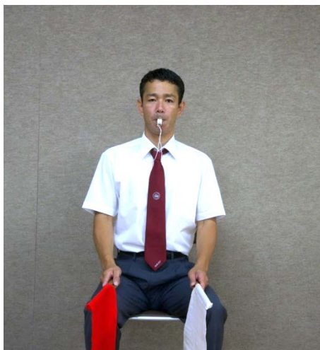
HANTEI for Referee and Judges Unroll your flags