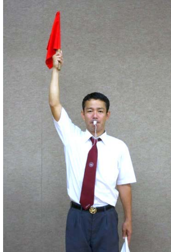
AKA NO KACHI in KOHAKU matches by the Referee Stand up, take one step forward and lift the red flag straight up