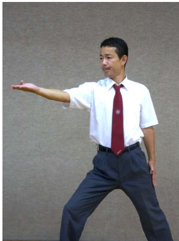
YAME Showing the opinion AKA WAZARI