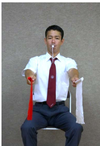
MAAI Hold flags parallel apart