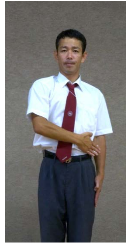
AKA IPPON / AKA NO KACHI

Arm from the opposite hip up in an 135° angle