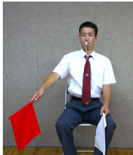
AKA TOHI Circle flag pointing downwards