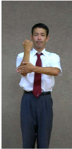
AKA UKETERU Here AKA blocked SHIRO's technique