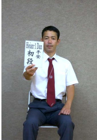
Announcement of kata in Kohaku matches by the Referee

Following the gestures for the Referee and Judges during a KATA match: