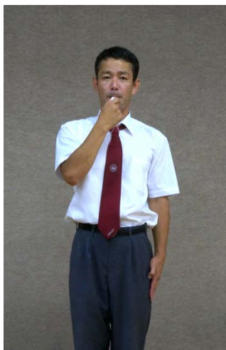
HANTEI (only in case of HIKIWAKE at the end of SAI SHIAI in individual matches) Two blows with the whistle