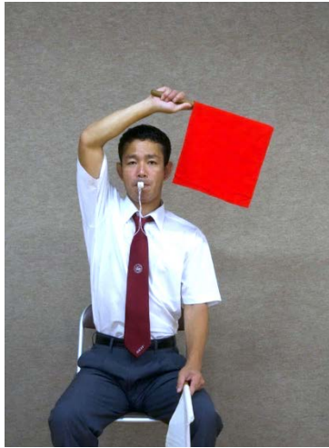
AKA HANSOKU Large circle straight up