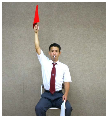
HANTEI for Referee and Judges Upon the second whistle tone show your opinion, in this case AKA NO KACHI