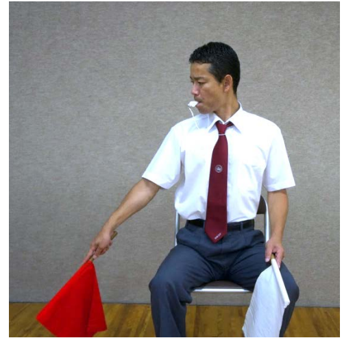
AKA JOGAI Point flag at the line