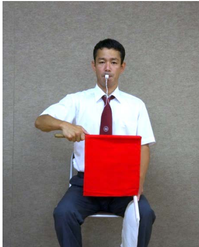
AKA CHUDAN NUKETERU AKA's technique passed