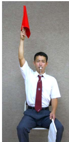
AKA IPPON Arm straight up