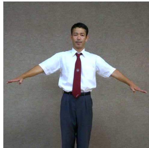
TORIMASEN Both arms 45°, palms facing down