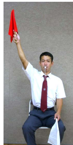
AKA HANSOKU CHUI Small circle straight up