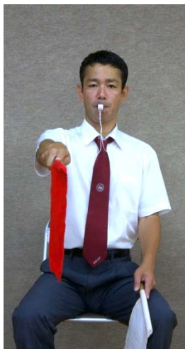
AKA KEIKKOKU Small circle in front