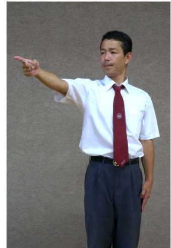
AKA HANSOKU Point at the face of offender with the index finger