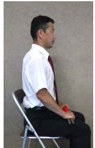
Correct waiting position with the flags rolled up for the Referee and Judges