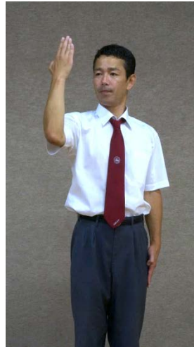
FUKUSHIN SHUGO (calling one Judge) Sweeping motion from the front in