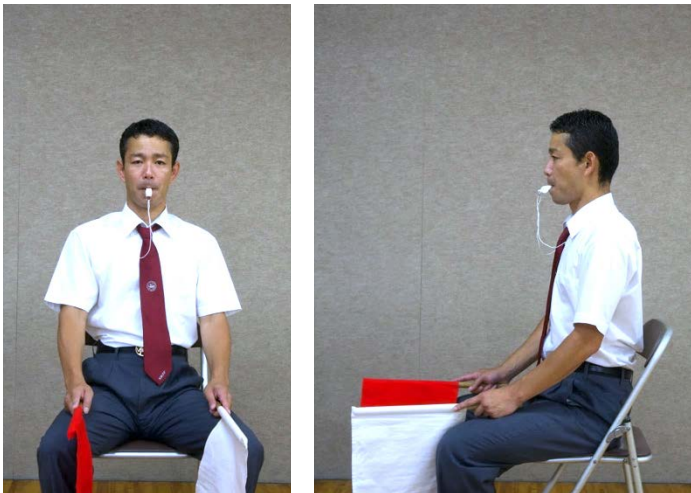
Correct sitting position

Following the gestures for the Judges during a KUMITE match: