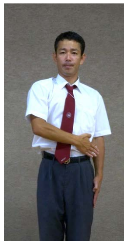
AKA NO KACHI Arm from the opposite hip up in an 135° angle