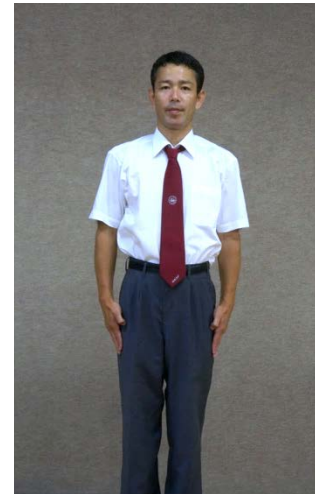
SHOBU HAJIME ENCHO SEN HAJIME SAI SHIAI HAJIME Feet together, hands open